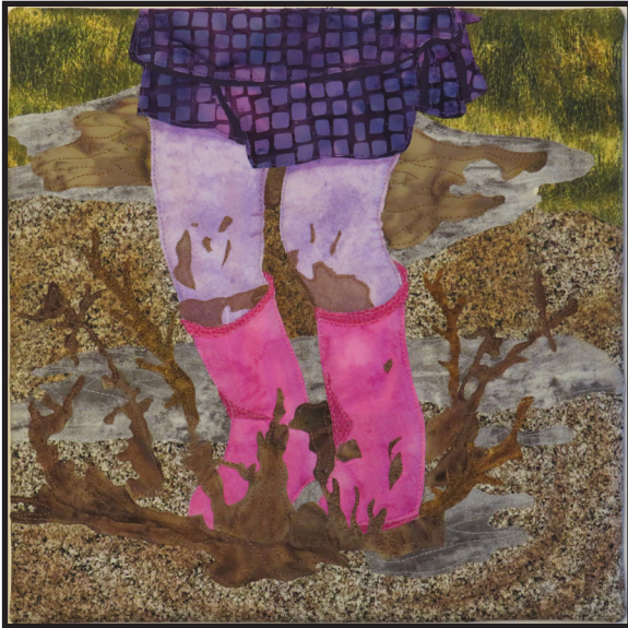
Mud Glorious Mud

pivotal. “Maybe it’s the smaller size. I think I was free, more open to play. It’s just 12 inches.” She adds “If it works out, well great. If not, you just start over.”