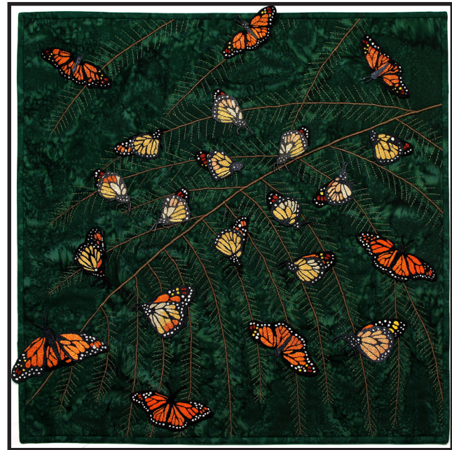
“Monarchs: Souls of the Dead.”