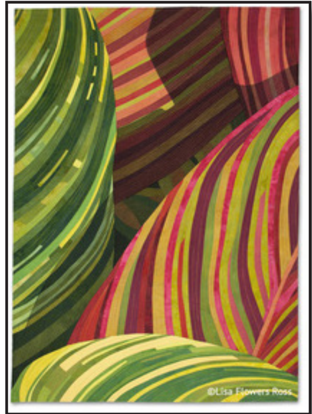
“In Vein III”